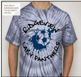
Grey tie dye short sleeve T-shirt @ $12.00

Players, parents, family members and friends can show their support for the team by wearing this year's spirit wear. Order forms were given out to the players last week or you can print out this page. The design was the work of our seniors. Please return the form with the cash or a check made payable to Ridgeview High School by Friday 4th November of next week if you wish to order any of the items on the form. You can purchase short sleeve grey tie dye T-shirts, white long sleeve T-shirts, grey hoodies and black quarter zip pull ons. You have the option of adding a name and number to the back of the white long sleeve T-shirt for $5.00 extra or your name and number to the front of the black quarter zip pull on for $6.00 extra.