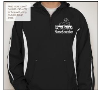
Black pull on with quarter zip @ $30.00