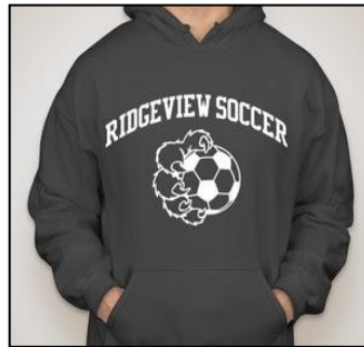
Grey hoodie @ $17.00