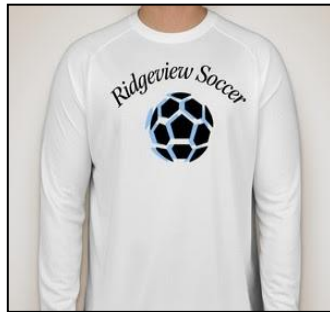
White long sleeve T-shirt @ $11.00