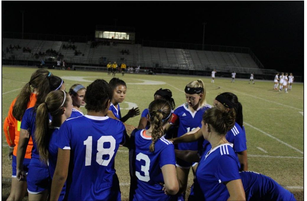
The varsity team get ready to take to the field

The Lady Panthers were on the defensive in the varsity game. The Spartans, with their speed and crisp passing, were a force to be reckoned with, and the Panthers struggled to contain them. The first half ended 0 – 3. The second half continued with the Panthers on the back foot. Any attempt to apply pressure on the opposition resulted in a turnover and an attempt on goal. The Spartans scored five additional goals in the second half and the game ended eight minutes early with the final score 0 – 8.